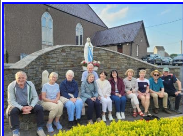
Rosary Gathering at Farran Grotto

https://www.idonate.ie/event/WalknRoll2026